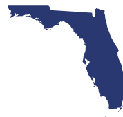
Funvitational May 11 SATURDAY