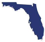
FCDI State Championship April 20 SATURDAY Lake Brantley HS