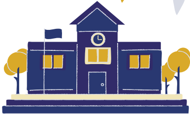
Central FCDI In Person