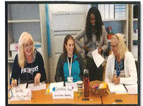
Teachers collaborate during MMCI Training

Creative Curriculum As a program, we continue to build our momentum using Creative Curriculum , our researched based curriculum, with fidelity. To this end, classroom teams can expect to see an increased focus on the daily use of Creative Curriculum through professional development, program monitoring, administrative walk throughs, and an increase in professional dialogue involving the components of Creative Curriculum . Additionally, Head Start purchased Digital Tools to assist with daily planning.