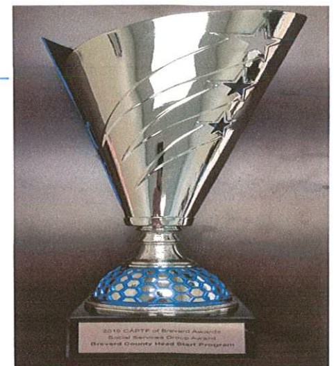
2019 CAPTF of Brevard Social Services Group Award BPS Head Start

Head Start teachers: work closely with their students, invite community helpers to school, share science lessons, and teach letter/sound awareness in creative and developmentally appropriate ways!